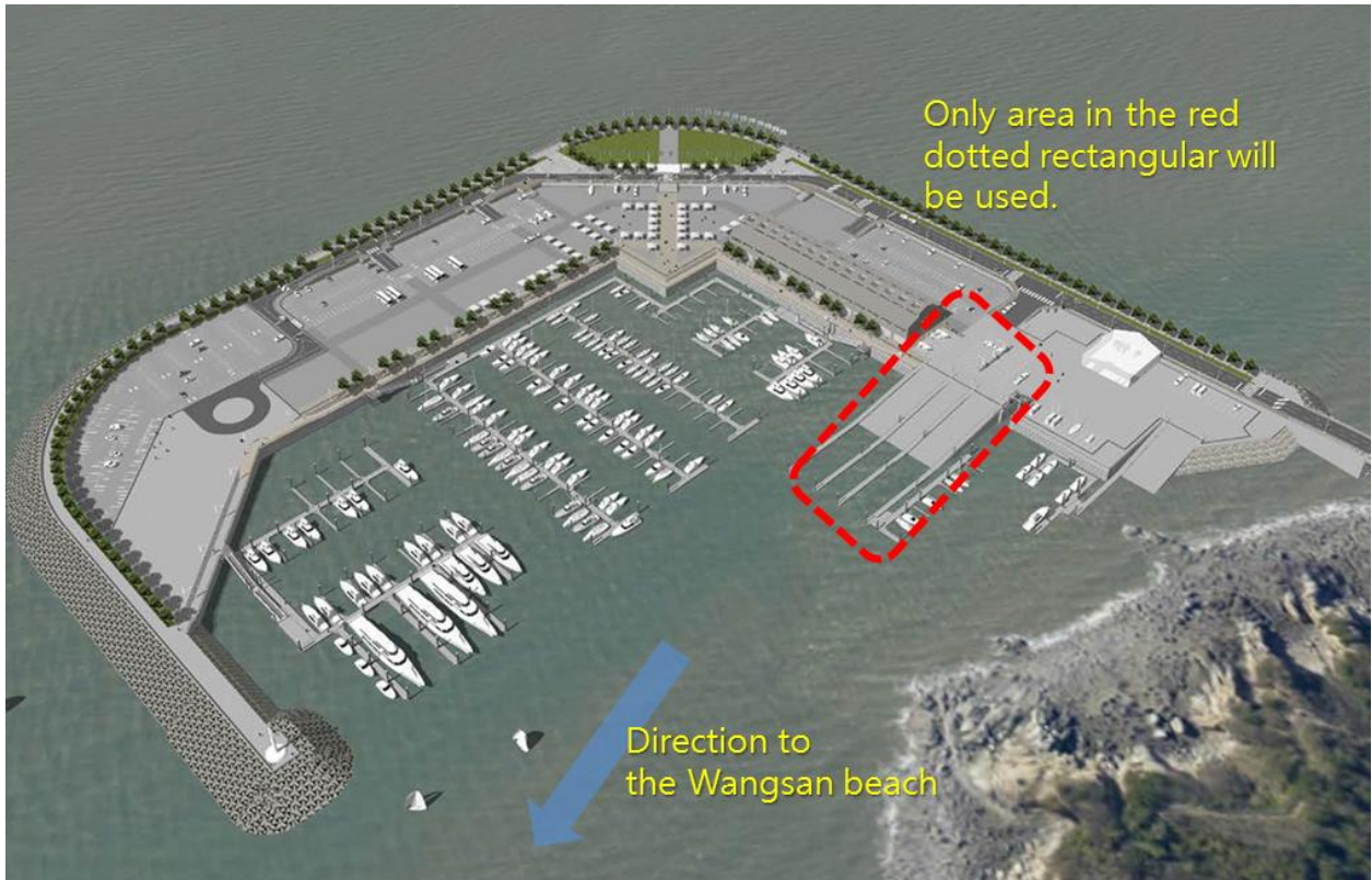
Using Area in the Wangsan Marina