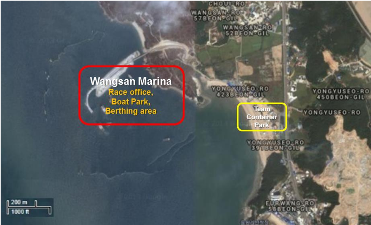
Wangsan Marina and Team Containers Parking Area