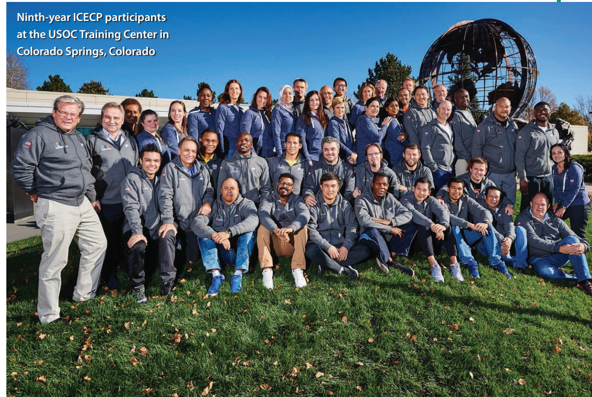
Ninth-year ICECP participants at the USOC Training Center in Colorado Springs, Colorado

"This is a very high classed coaching course taking into consideration its content and intensity, great idea to keep, there should be a follow up of past participants after they pass through this program for an international network. There should be a physical exercise by all coaches as a group twice a week, a proper tour of the gym because some of us saw certain machines for the first time. Thanks for all the great work!"